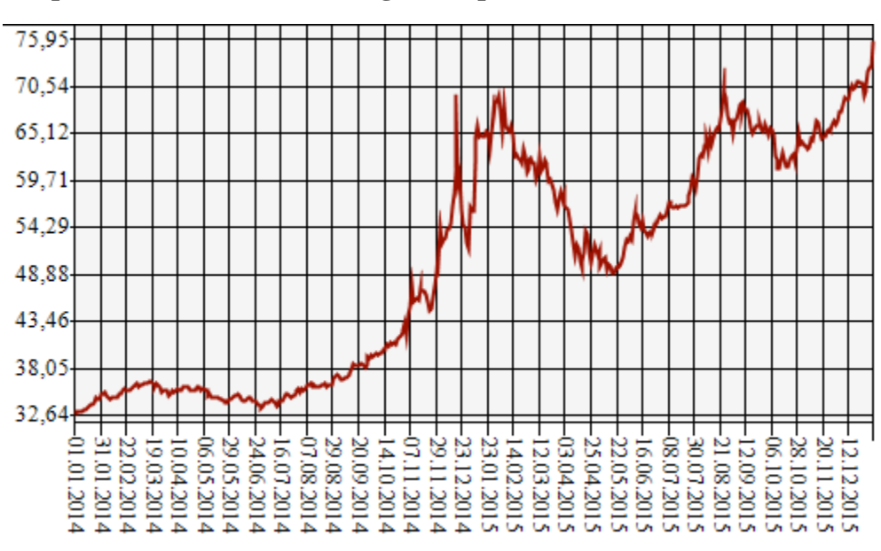
Graph 1 Russia: Ruble Exchange Rate per U.S. Dollar, 2014 – 2015

According to Russia's Federal State Statistics Service (Rosstat), Russia's headline consumer price index (CPI) totaled 12.9 percent in 2015, up from 11.4 percent in 2014 and its highest level since the financial crisis of 2008 when consumer prices rose by 13.3 percent. At the same time, the food products component of the headline CPI number decreased to 14 percent in 2015 from 15.4 percent in 2014. Consumer price inflation in Russia was spurred by the weakening of the ruble in the second half of 2015 stemming from the sliding oil price, which continued in January 2016. The official ruble rate hit a record low of 83.6 rubles per 1 USD on January 22, 2016.